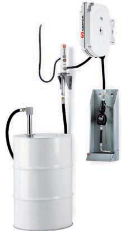
WALL MOUNTED 3:1 OIL PUMP PACKAGES WITH ENCLOSED TYPE HOSE REEL