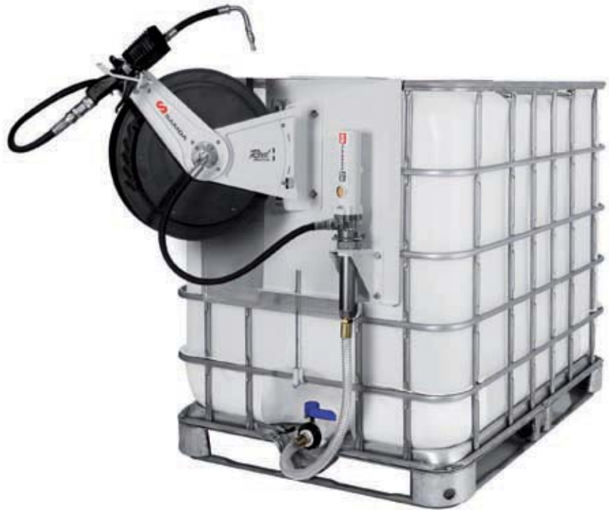
3:1 OIL PUMP WITH HOSE REEL PACKAGES FOR 1000 LITRE IBCS

As above, but with double pedestal arm reel with 10 m hose (PN 501 200) instead of reel 506 202.