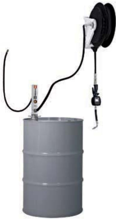
DRUM MOUNTED 3:1 OIL PUMP PACKAGES WITH HOSE REEL