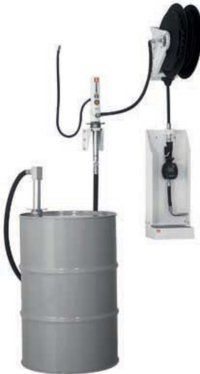
WALL MOUNTED 3:1 OIL PUMP PACKAGES WITH OPEN TYPE HOSE REEL