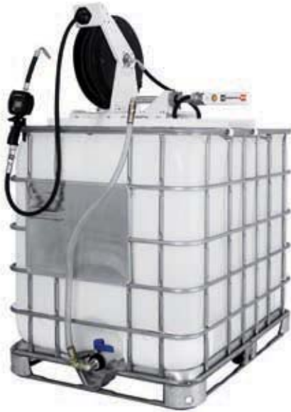
3:1 OIL PUMP WITH HOSE REEL PACKAGES FOR 1000 LITRE IBCS